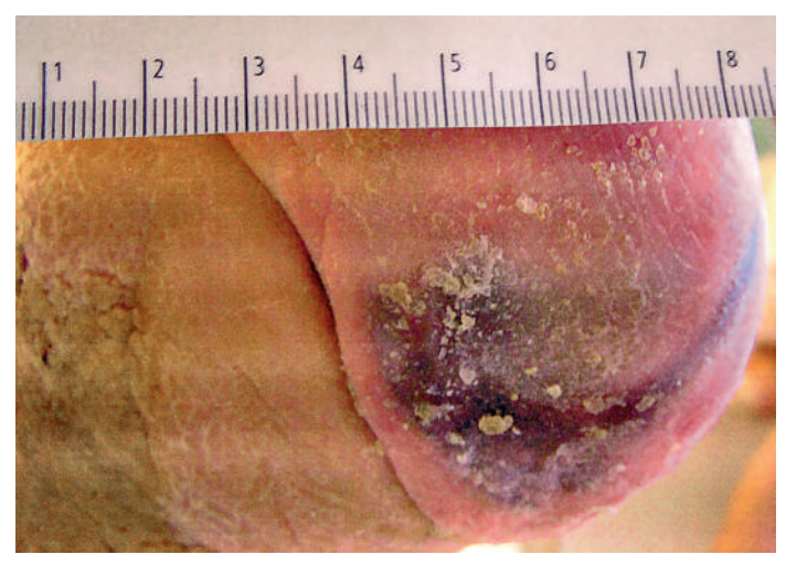
Figure 5 Right heel.