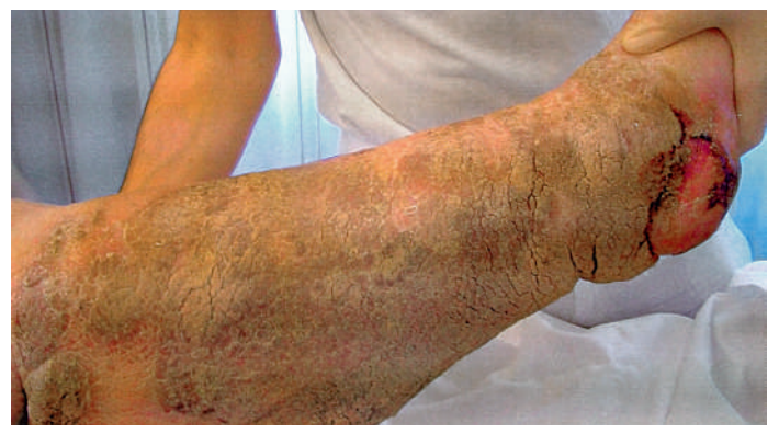
Figure 1 Left lower leg, medial side.

She was diagnosed with papillomatosis cutis carcinoides. After complete washing we applied 3% salicylvaseline two times a day. With this therapy the wax like covering could be removed day by day with the blunt long side of a forceps. After multiple necrectomies, the decubital ulcer was closed with a skin flap by plastic surgeons. With the help of the physiotherapists the patient could mobilise herself at the end of the stay in our department from lying position to the edge of the bed. After 85 days, the patient was discharged and admitted to a nursing home.