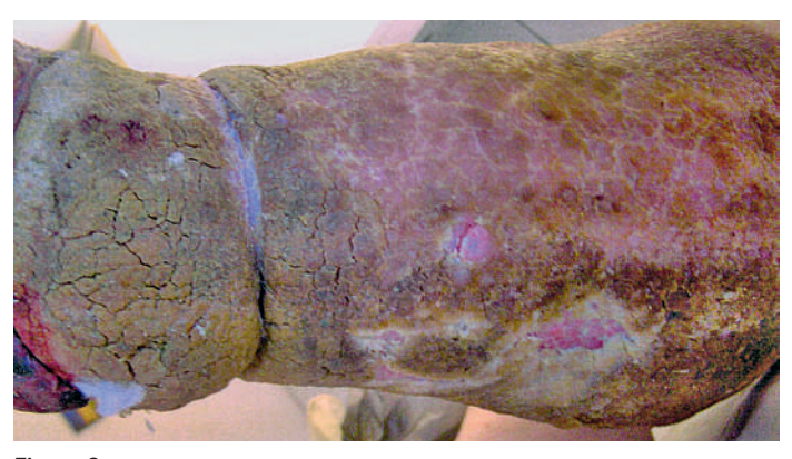
Figure 2 Left lower leg, lateral side.