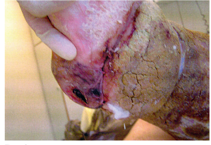
Figure 3 Left ankle.