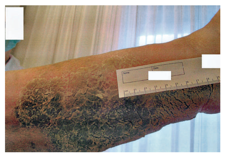
Figure 4 Right lower leg.